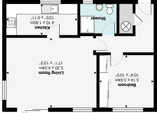
45 Martletts Court, Crowborough TN6 2YE

Total Area: 51.0 m 2 ... 549 ft 2 All measurements are approximate and for display purposes only